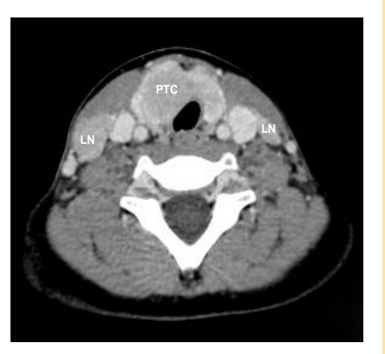
CT scan of a 6-year-old with papillary thyroid cancer (PTC) and bulky bilateral lymph node (LN) metastases.

Children with thyroid cancer usually present with an asymptomatic thyroid mass and/ or cervical lymphadenopathy. Lymph node metastases are present in the majority of PTC cases and lung metastases are identified in up to 20% of cases; metastases to other sites occur but are rare.