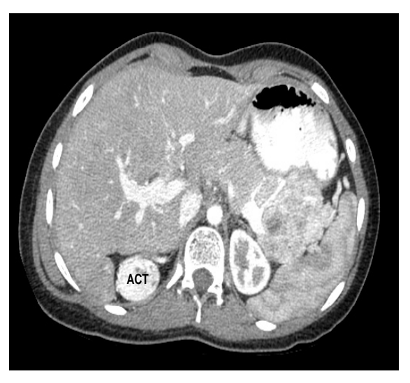
Adrenocortical tumor (ACT) in a 12-year-old patient with Beckwith-Wiedemann Syndrome.

Most children with ACT or PHEO are treated with surgical resection, but systemic approaches to therapy are typically required in the case of malignant disease that is present outside of the adrenal gland. Children with PHEO who proceed to surgery are pretreated with alpha (and possibly beta) blockade.